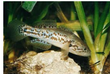
Southern purple-spotted gudgeon

A rescue and recovery project has seen both these species rescued from a number of locations where their habitat was at risk of completely drying. The rescued fish then became part of a captive breeding program.