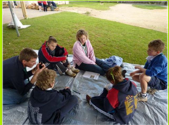
Bordertown Primary School work on their action plan