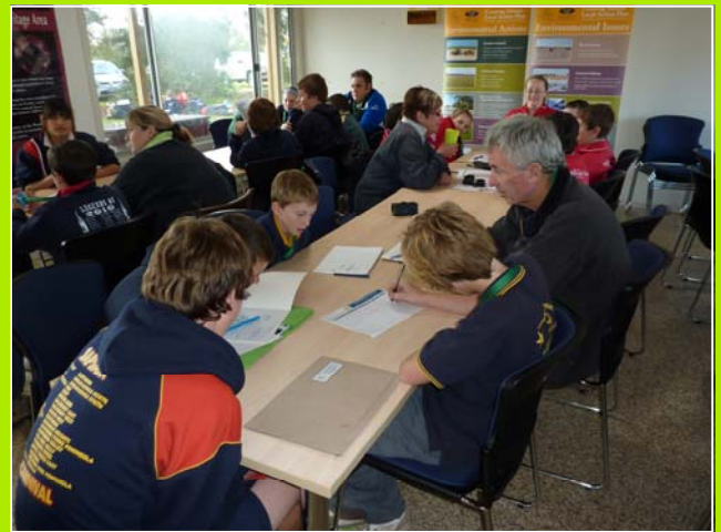
Padthaway Primary School talk about the importance of waste management and explore options for their Chicken Coop Committee.